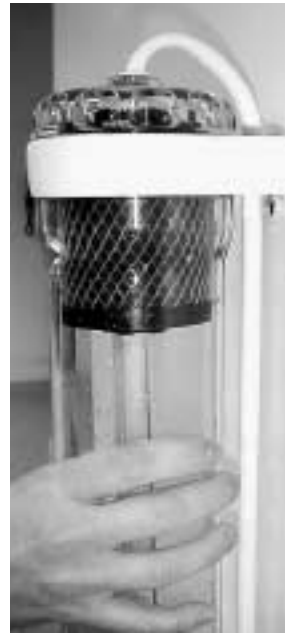
Figure 8 Hanging unit on Wall Mounting Pins